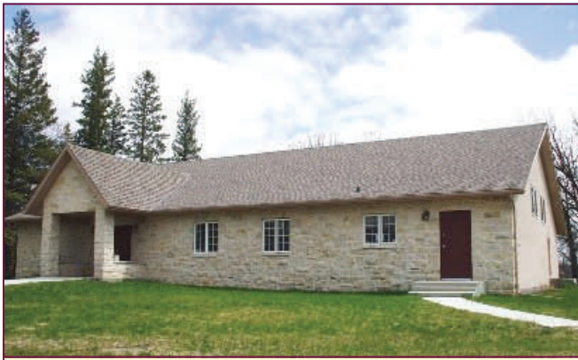
Little Britain United Church hall built in 2004.