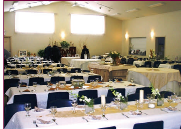
Little Britain United Church hall interior, set up for a shower.

I n 2004, Little Britain United Church fulfilled a long-time dream and built a brand new, 4800 square-foot hall to replace an outdated, fifty-year old hall.