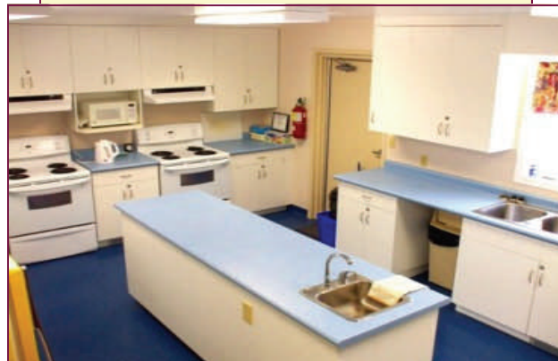
Little Britain United Church hall kitchen.