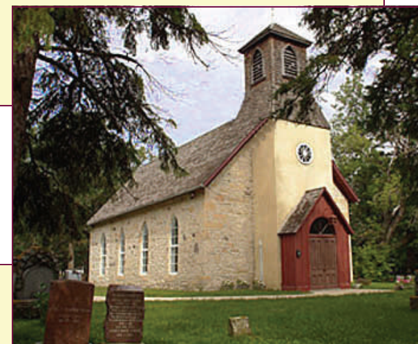
Little Britain United Church, established in 1852.

H istoric Little Britain United Church is an active and welcoming faith community nestled among the oaks on the banks of the Red River.